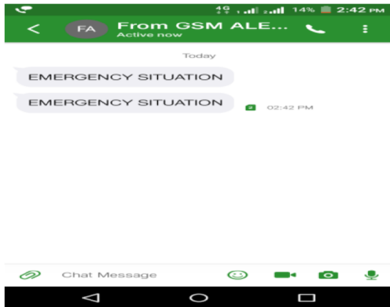
Fig. 4 Message from GSM SIM800A