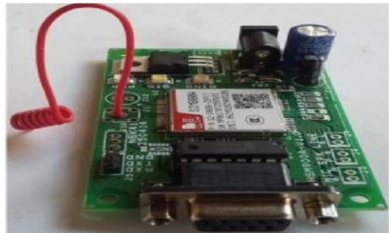
Fig. 2 GSM SIM800A module